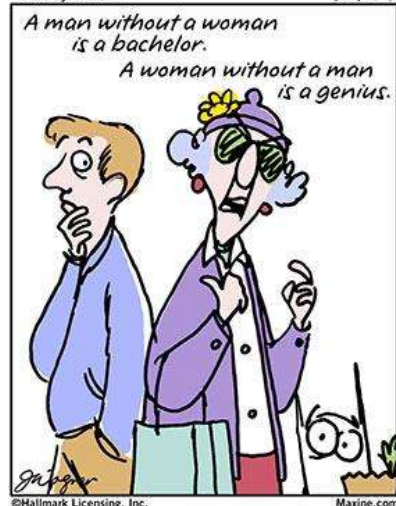
Crabby Road 6-4-07